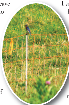
A bluebird perched on an electrical fence post singing its song