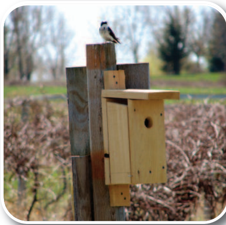
A tree swallow taking ownership of a newly mounted bird house

The most notable birds that have increased considerably since our arrival at our farm are the Eastern Bluebird, the Tree Swallow, the House Wren, the Savannah Sparrow, and the Bobolink. The three former birds have one thing in common: They nest in caves. Caves are easy to imitate by building birdhouses. In my search for suitable and reasonably priced lumber to build these birdhouses, I came across a local sawmill run by a Mennonite. I knew how much wood I needed and how wide and thick I wanted the boards to be, but I was uncertain as to what kind of wood it should be. I asked the mill owner which lumber would be most suitable for drilling screws and making holes without splitting the wood. He asked what I wanted it for. I didn't come right out with the answer since I thought he might think I am crazy for wanting to build birdhouses. After all, I was new in town and didn't want to build a reputation of being some sort of crazy person. I figured he would not understand, being Mennonite and thus living a very conservative lifestyle, and being interested in birds and wanting to build houses for them are mutually exclusive, so I thought at the time. Eventually I had to reveal what they were for. He suggested pine, mentioning that it is less likely to split