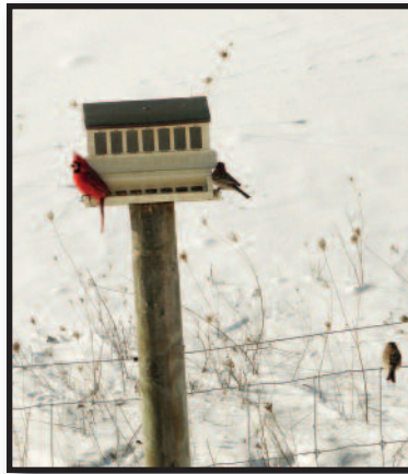
The sight of a cardinal at a bird feeder with snow as the background never fails to please

ground and kept coming back to the same area. I have no idea if the purpose was ever met since no ground nesting bird flies directly up from its nest and instead always runs away first before it lifts off. So, let's leave it at least in my imagination that it did do some good.