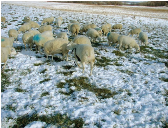
Some of these ewe lambs have been bred. The blue markings on their backs are the result of the use of the breeding harness

usually don't separate my flock into different groups far beyond one cycle since most sheep will be bred within one cycle. Depending on how critical inbreeding may be, I may leave only one ram in with the flock