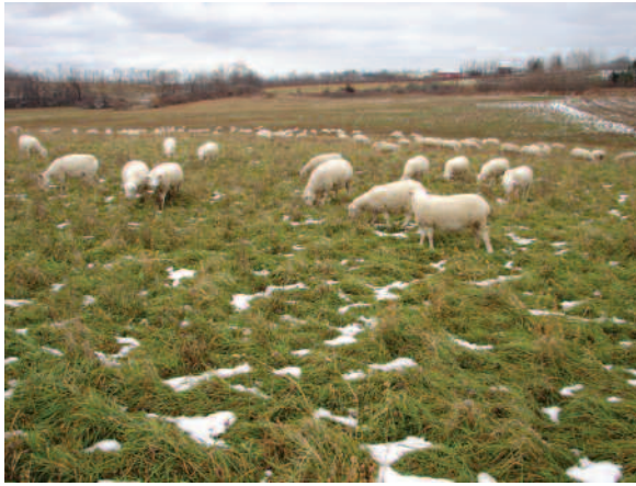
My sheep graze stockpiled pasture well into December and January.

SHEEP: The choice of sheep is of paramount importance. Due to the creation of show sheep and due to feed lot practices, there are nowadays many sheep that do not thrive on grass. Their rumen capacity is too low and their maintenance too high to raise them solely on pasture and have them perform without grain. I suggest looking at where the sheep come from, and under what circumstances they are kept. A farm that advertises show records instead of