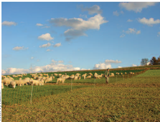
My electric nettings allow me to graze sheep wherever, whatever, whenever. Here I am grazing the neighbor's wheat field.

I use my electric nettings on my own property to create my cells for rotational grazing. In the hot summer months I always include a source for shade such as trees and parts of a hedgerow. When I create one cell, I usually think ahead