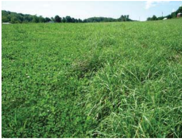
Ryegrass (left) and orchard grass (right) yield significantly different under the same low-input conditions.

The biggest downside of “native” orchard grass is that it heads out extremely early and immediately loses all palatability. However,