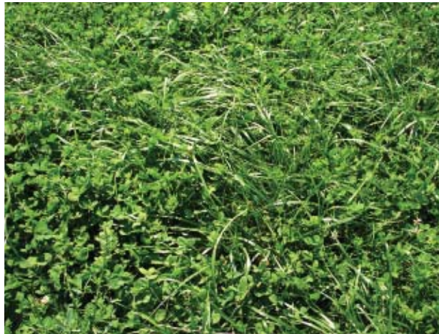
Tall fescue yields well but is not much liked.

once the seed stems are bush-hogged, it yields well throughout the rest of the summer and fall and stays quite palatable. The late-heading Baraula is so far the clear winner at my farm. It heads out 2+ weeks later than “native” orchard grass. Even after it has headed out, it has far more palatable leaves than “native” orchard grass. It yields very well without much input and it stockpiles well. I am very pleased with it. Last year I had some “Athos” orchard grass seeded with a no-till drill. Athos is also a late-heading orchard grass. It is too early to tell how this worked out.