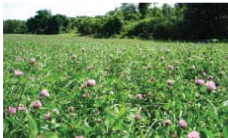
Letting the stand of red clover mature reduces the risk of bloat.

I also frost-seeded Ladino white clover in a newly acquired 20-acre parcel. I chose that one despite my previous bad experience simply to try yet another variety of white clover. Since it is the first year of its establishment, the jury is still out on this one.