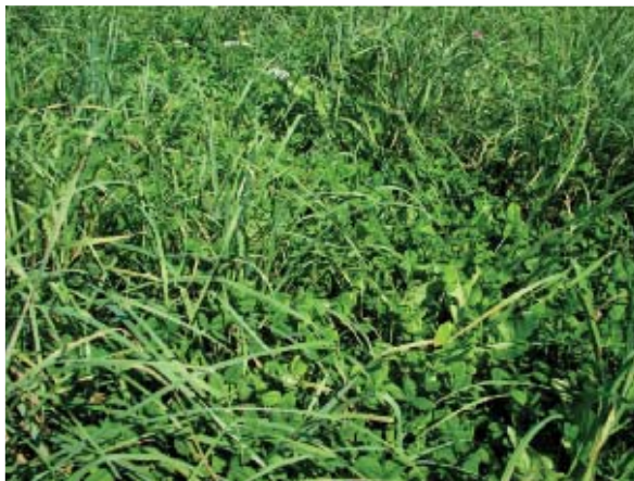
Orchard grass and (Huia) white clover are desirable species in a sheep pasture.

A good chunk of it was hayfields that hadn't been used in several years and needed to be bush-hogged to rid them of weeds