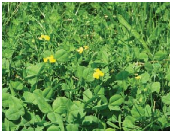
The tanning agent of bird's-foot trefoil (yellow flower) inhibits reproduction of stomach worms.

Bird's-foot trefoil is a none-bloating legume. Sheep like it in measures. It doesn't yield very much in comparison to clovers. Other than being none-bloating and nitrogen-fixating, it has the advantage that its tanning contents inhibit the growth of intestinal worms such as the deadly barber pole worm. This is my only reason for seeding it. I had interseeded trefoil in my 14-acre test plot. It took two to three years to establish the stand. Now it is well established. Meanwhile, I had a ten-acre parcel seeded with a no-till drill and frost-