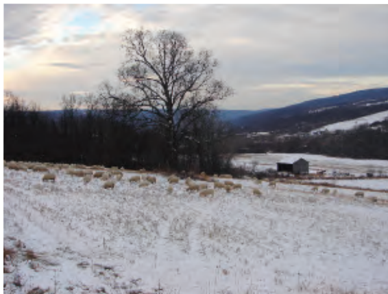
Grazing sheep requires a very special knowledge about sheep to make a profit, not just knowledge about grass farming alone.

“Kick the hay habit; graze all winter.” It is true that too many people still feed too much hay and thus cut deeply into their profit margin. It is also true that a stand of third cutting most likely doesn't need to be hayed and can be grazed instead. Stockpiling pasture and grazing harvested fields can greatly extend the grazing season. I have grazed many winters in New Jersey without feeding any hay. That was when I was single and had nothing else to do. Yet, even then I had to worry in every snowstorm if I would make it to the sheep the next day since I didn't have a tractor. I also didn't know if they could still dig through the snow, and at times I indeed had to pull hay to them with a toboggan. That sounds funny in hindsight but not while you are doing it, trust me. Today I am a few years older and have a family and have a life aside from farming. I have lost the fear of snowstorms since I now have a four-wheel-drive tractor and feed round bales. I still try to reduce hay feeding time and I currently have about 90 or less hay feeding days compared to the usual 150 or more hay feeding days in my area. I feed most of my hay out in the field, and since all my hay is purchased I also view the hay as fertilizer. Yet, I am not trying to do away with hay feeding. I would rather have my sheep eat hay on a