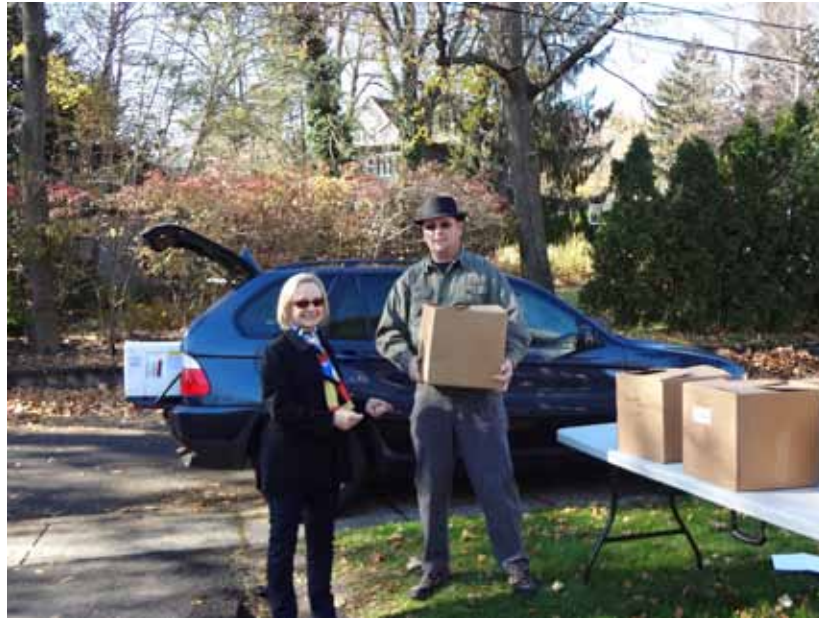
At my freezer lamb delivery place in New Jersey.